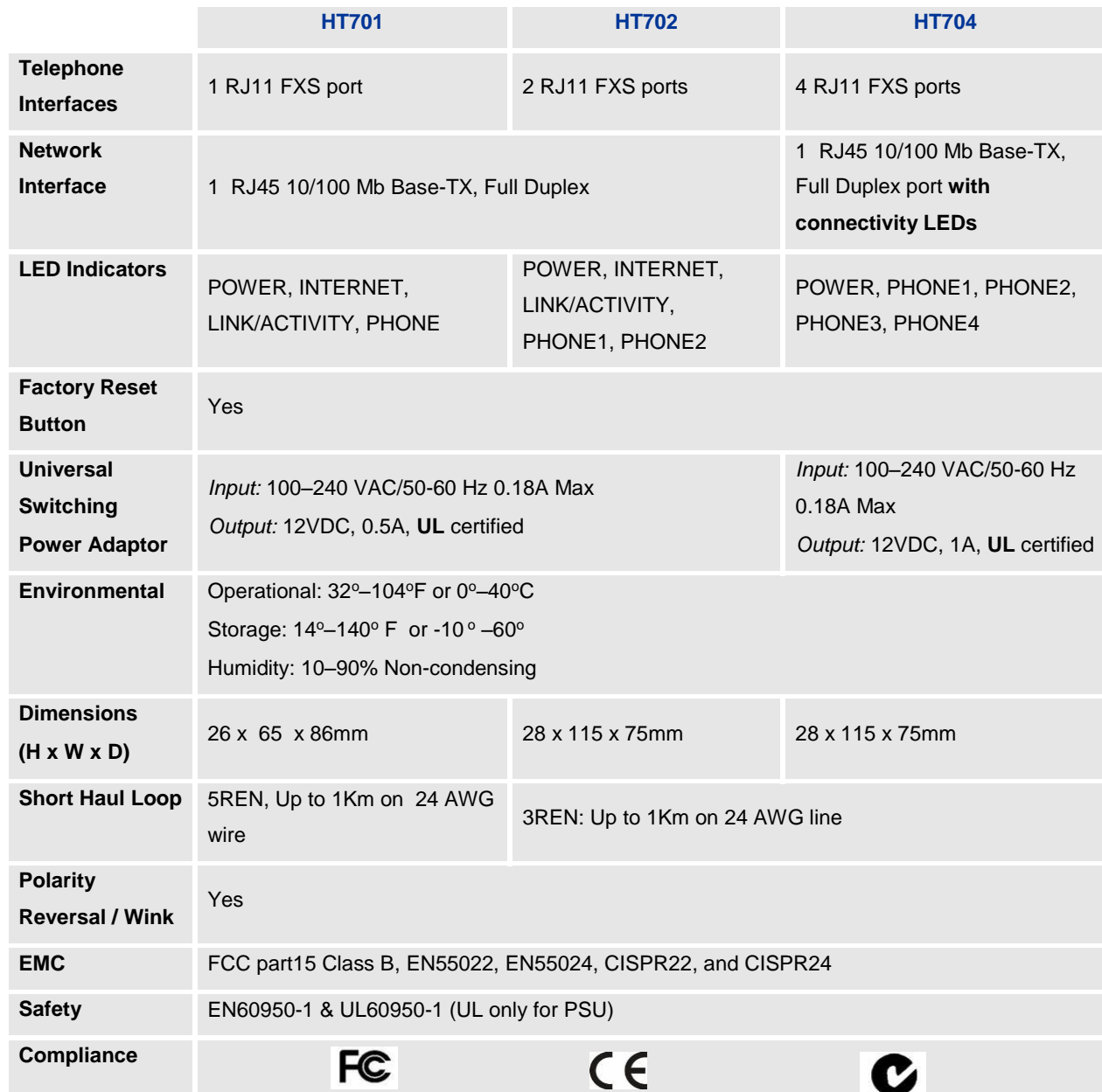
TABLE 5: HT70X HARDWARE AND TECHNICAL SPECIFICATIONS

The table below lists the Hardware and Technical specification of HT70X.